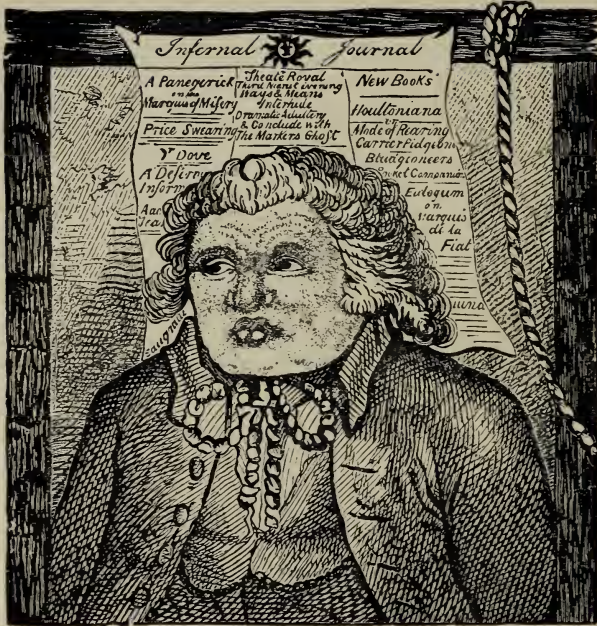
(From a Caricature of the day.)